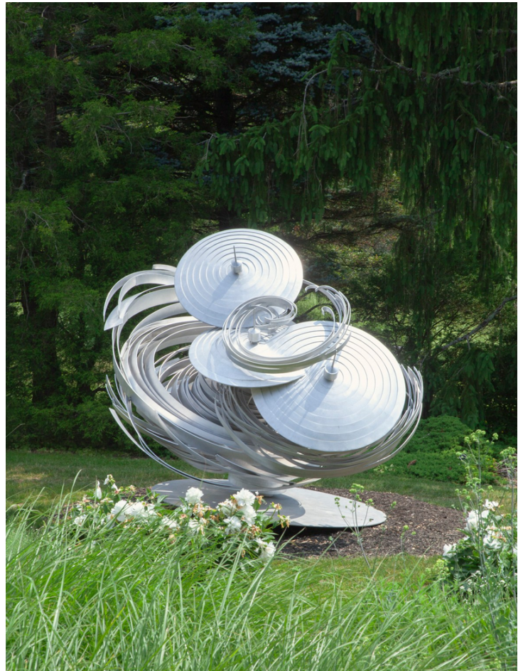
Alice Aycock's "Cyclone," on view at SAC

Learn more at southamptonartscenter.org/cocktail-party .