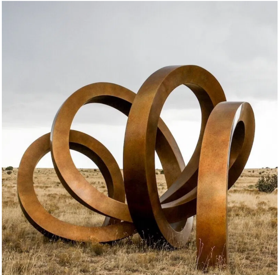
Gino Miles' "Shelter," to be installed at Bridge Gardens.

Bridge Gardens is open daily from 10 a.m. to 4 p.m. For more details, call 631.537.7440.