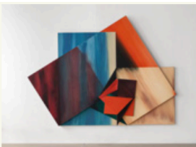
Dorothea Rockburne, Narcissus , 1985, in "In My Mind's Eye" at the Parrish Art Museum in Southampton, N.Y.

As the global art scene settles into its summer vacation, those very same vacationers are being lured by an assortment of art events, especially in the section of Long Island known as "The Hamptons." Herewith, a selection for just the first few weeks of July 2011.