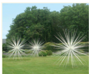
Norman Mooney, Wind Seeds , in "Uncommon Ground II" at Bridge Gardens in Bridgehampton