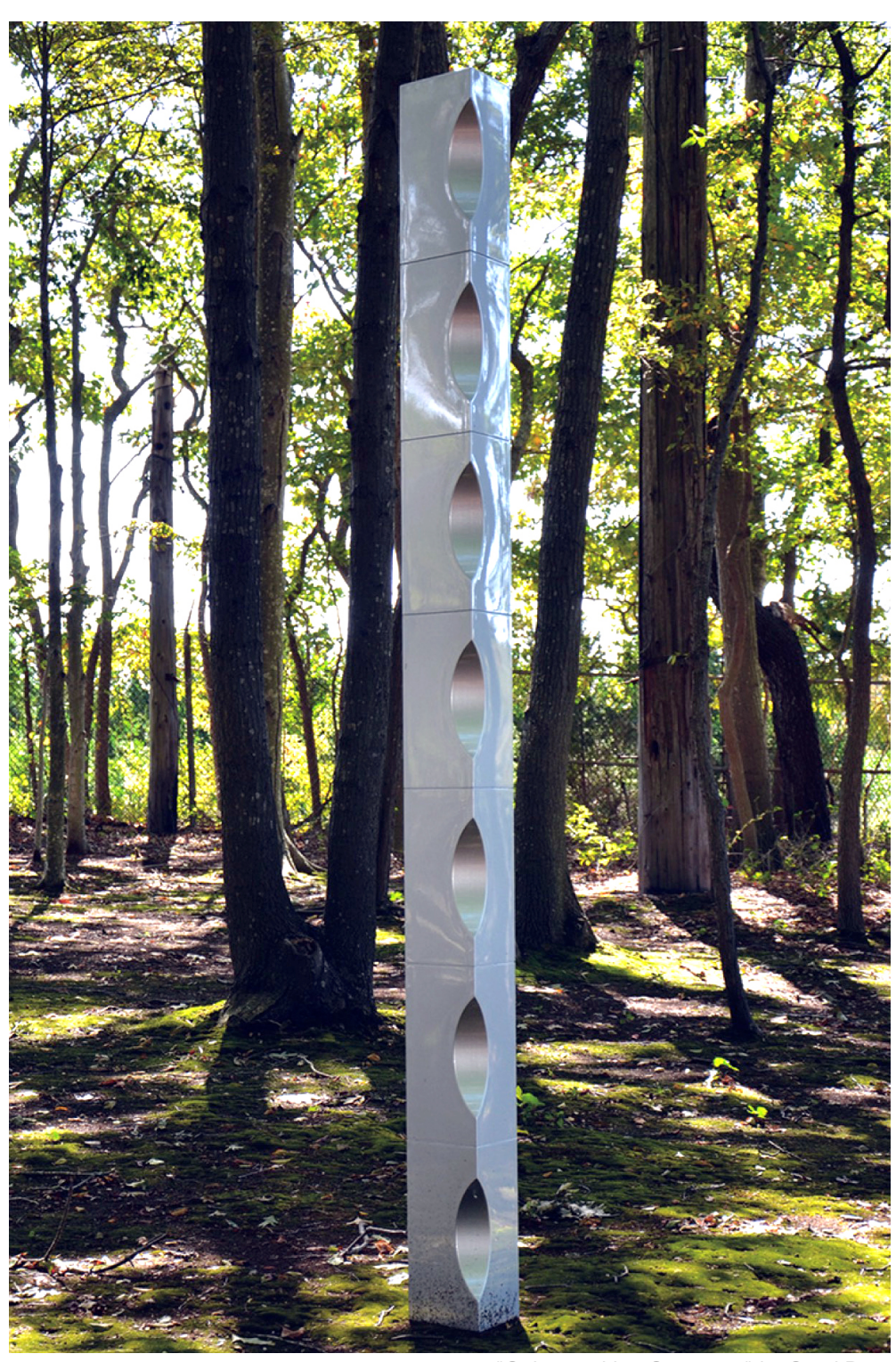
"Column with 7 Crescents" by Carol Ross