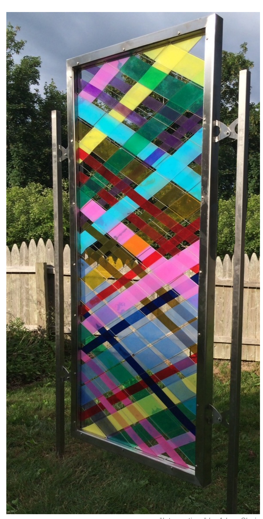
"Intersections" by Arlene Slavin