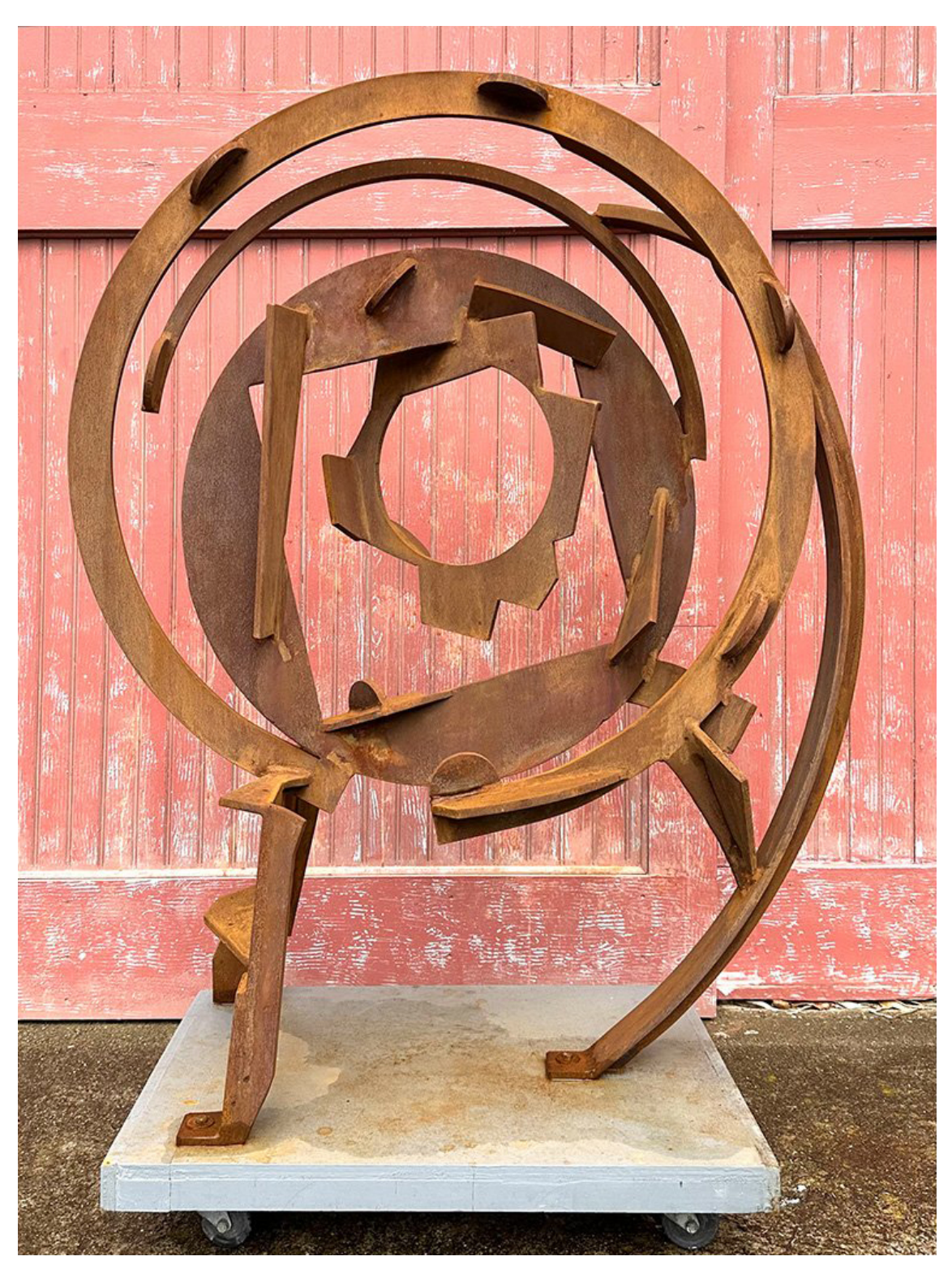
CONTACT "Round East" by Joel Perlman