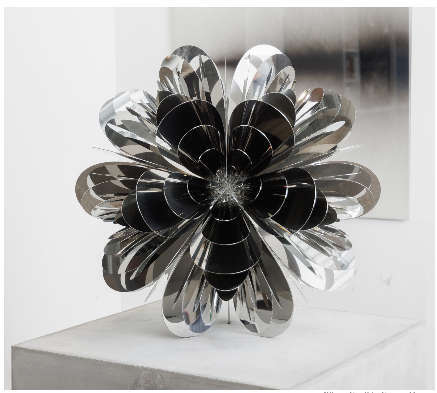
"Bloom No. 4" by Norman Mooney